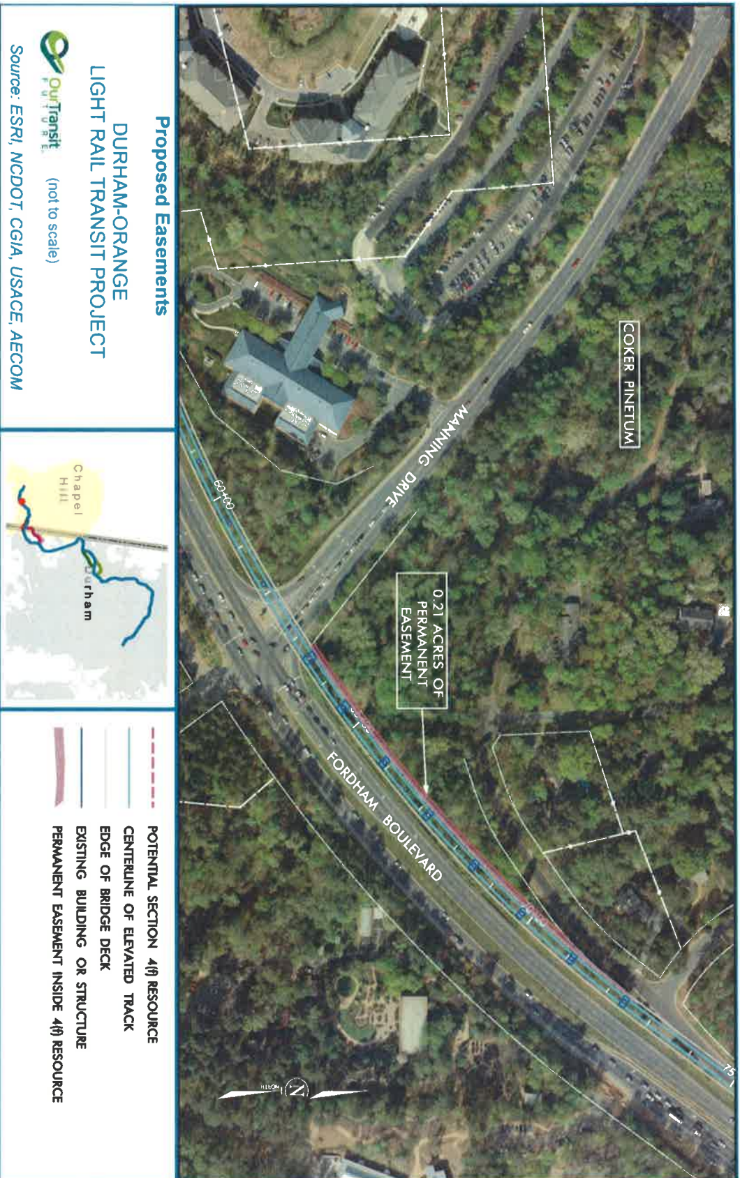
Figure 1: D-O LRT Project at UNC Coker Pinetum